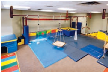
Large Motor Gym